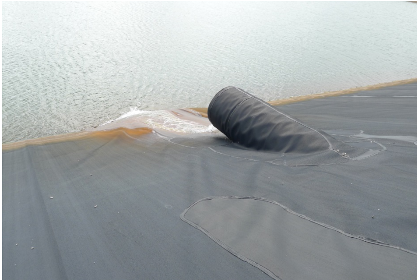
South Economizer Ash Pond (south side, looking southwest at bulge below central pipe discharging into the Long Term Fly Ash Pond)