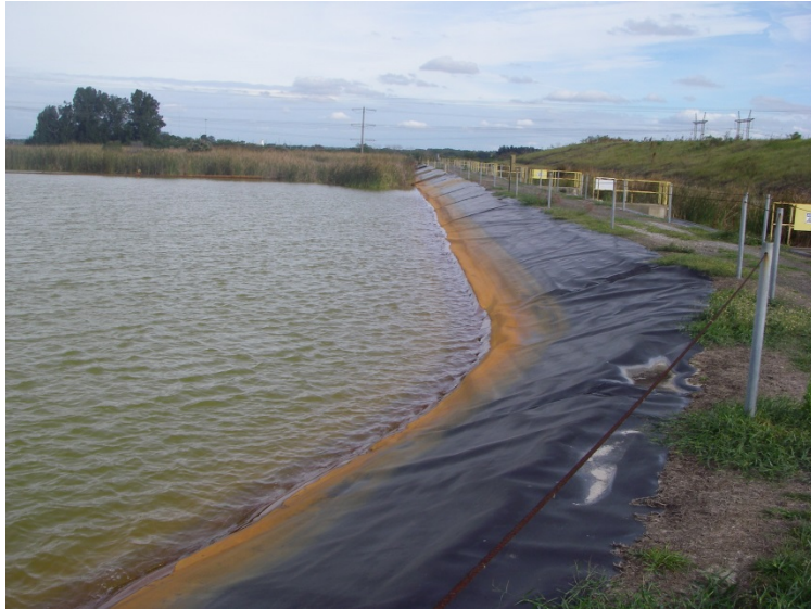
North Economizer Ash Pond (south side, looking east)