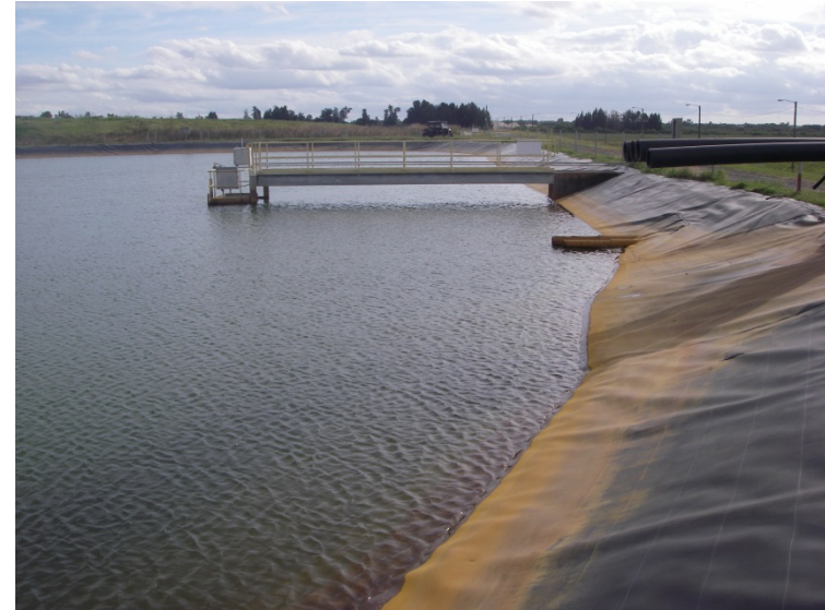
Economizer Ash Suction Pond (west side, looking south at instrumentation platform )