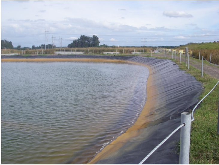
Economizer Ash Suction Pond (south side, looking east)