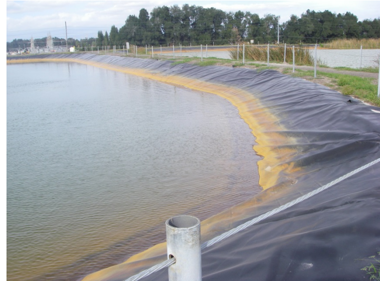
Economizer Ash Suction Pond (east side, looking northeast)