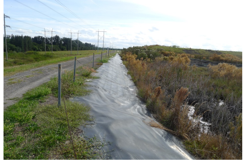
North Economizer Ash Pond (east side, looking south)