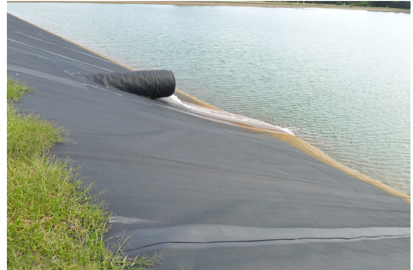
South Economizer Ash Pond (south side, looking southeast at bulge below central pipe discharging into the Long Term Fly Ash Pond)