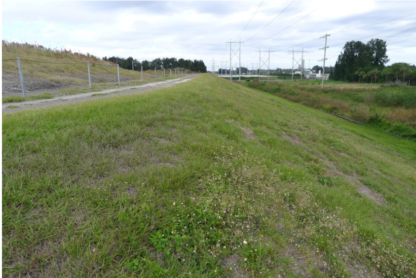
South Economizer Ash Pond (east side, looking north)