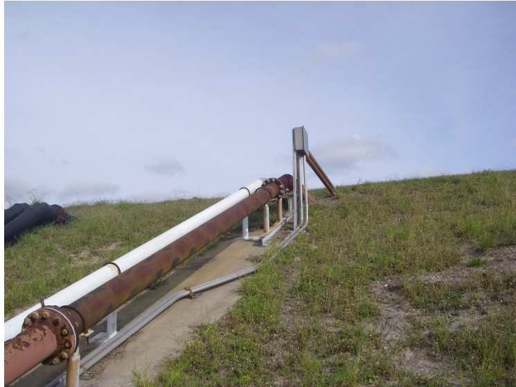
Economizer Ash Suction Pond (west side, looking east at embankment penetrations)