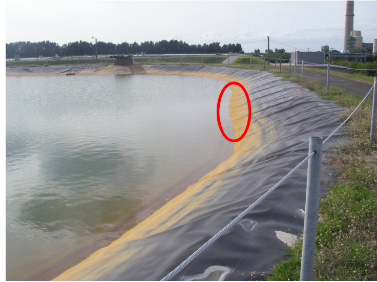
Economizer Ash Suction Pond (north side, looking west at irregular liner surface)