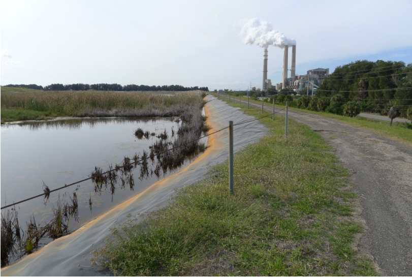
North Economizer Ash Pond (north side, looking west)