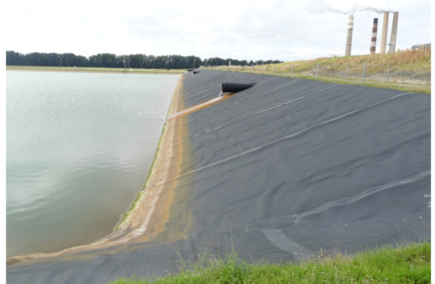
South Economizer Ash Pond (south side, looking west)