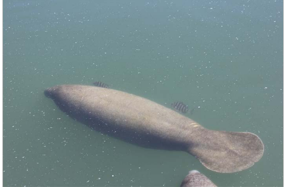
Activities were conducted under USFWS permit MA7733494