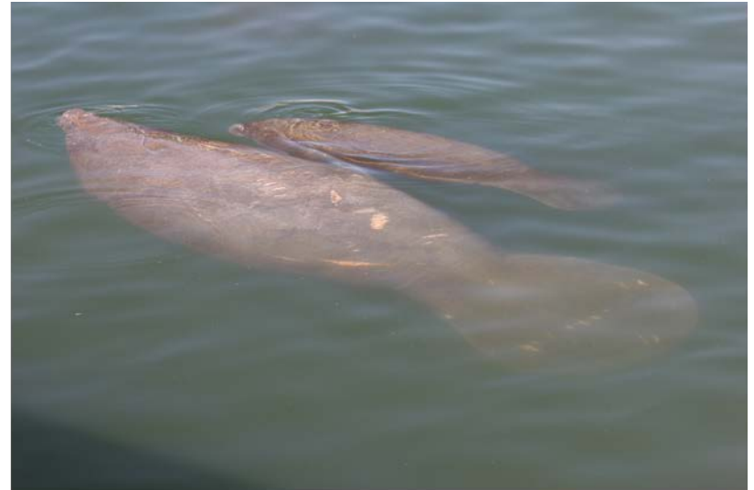
Activities were conducted under USFWS permit MA7733494