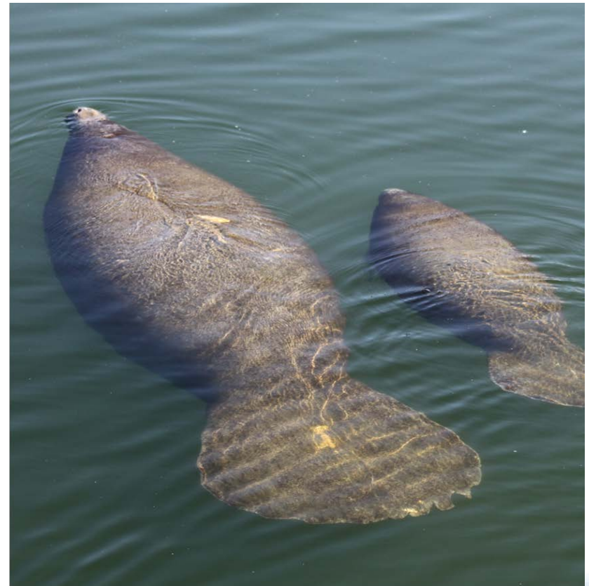
Activities were conducted under USFWS permit MA7733494