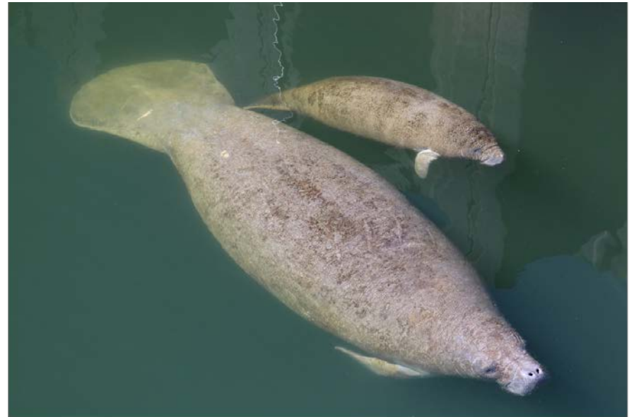
Activities were conducted under USFWS permit MA7733494