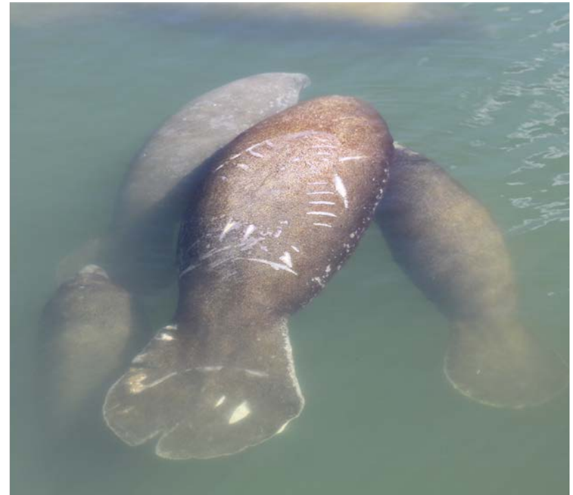
Activities were conducted under USFWS permit MA7733494